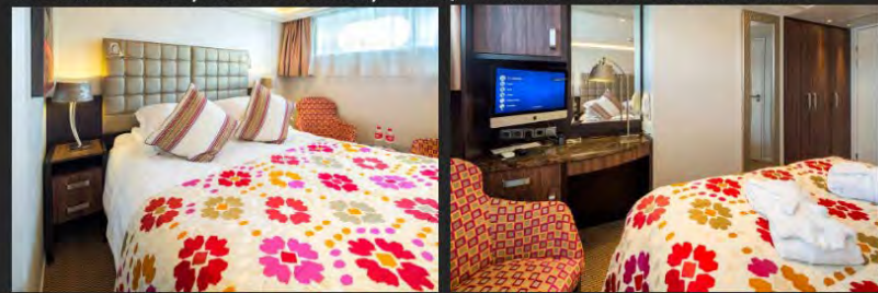
CATEGORIES E & D; FIXED WINDOWS, 160 SQ. FT. LOCATED ON THE PIANO DECK

Category E: double occupancy: $7100 pp single occupancy: $9255