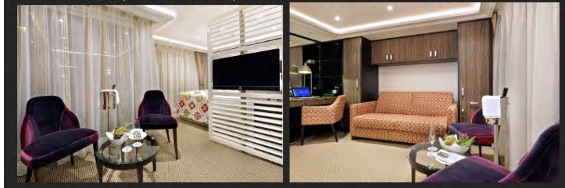
CATEGORY SUITE, TWIN BALCONIES, 350 SQ. FT. LOCATED ON VIOLIN DECK

Category S-Suite: double occupancy: $13400 pp single occupancy: NA