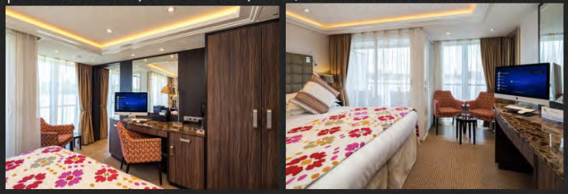
CATEGORY BB AND BA, TWIN BALCONIES, 210 SQ. FT. LOCATED ON CELLO & VIOLIN DECK

Category BB: double occupancy: $8310 pp single occupancy: $12465